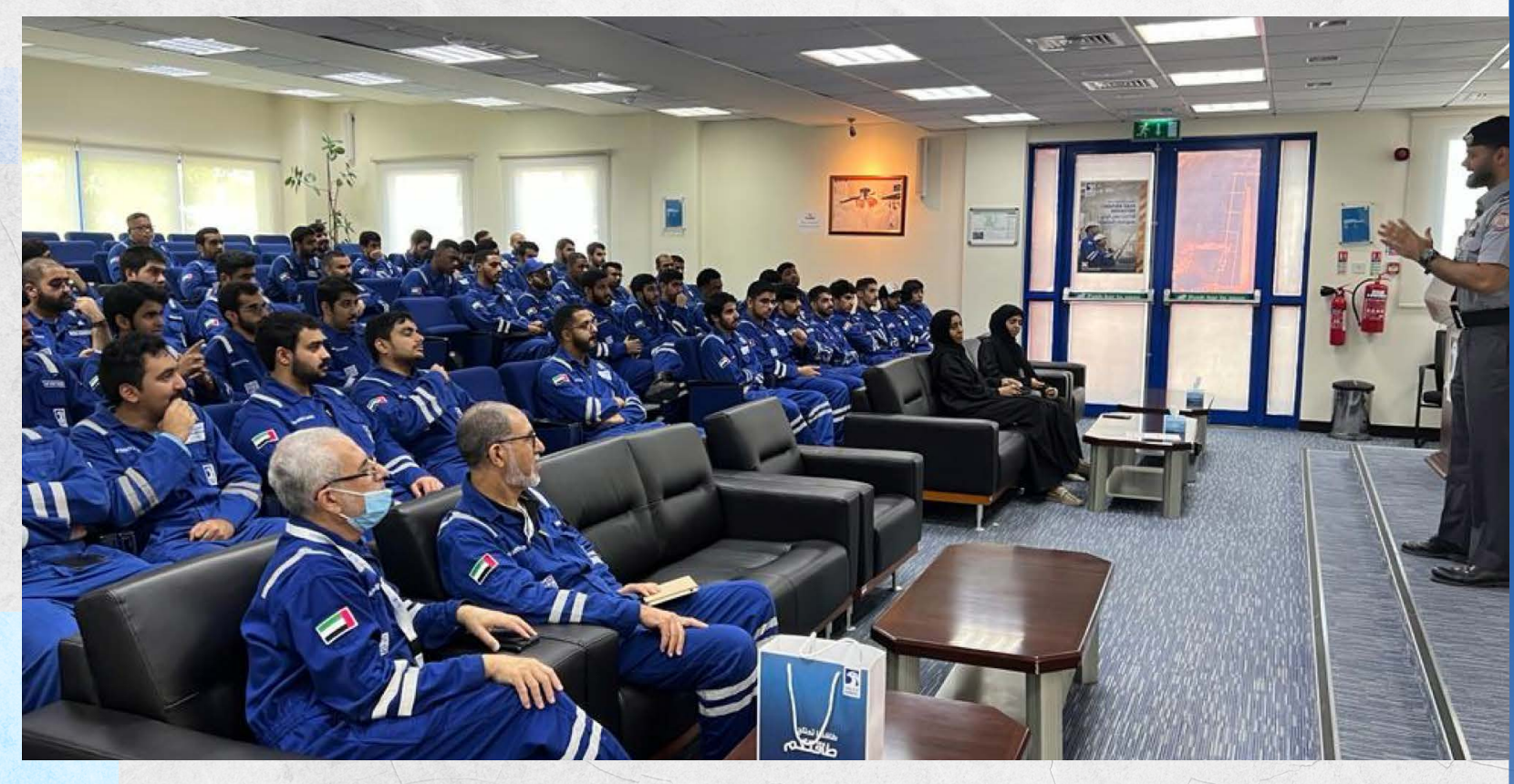
SAFE DRIVING & SEAT-BELT AWARENESS SESSION 27<sup>TH</sup> APRIL 2023