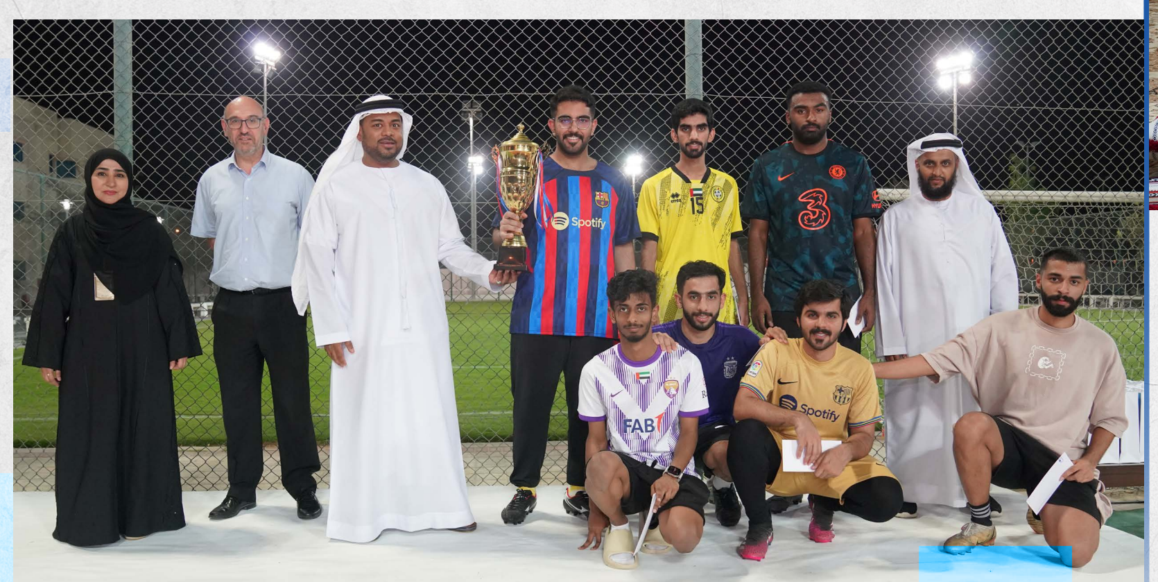
RAMADAN TOURNAMENT 10<sup>TH</sup> - 12<sup>TH</sup> APRIL 2023