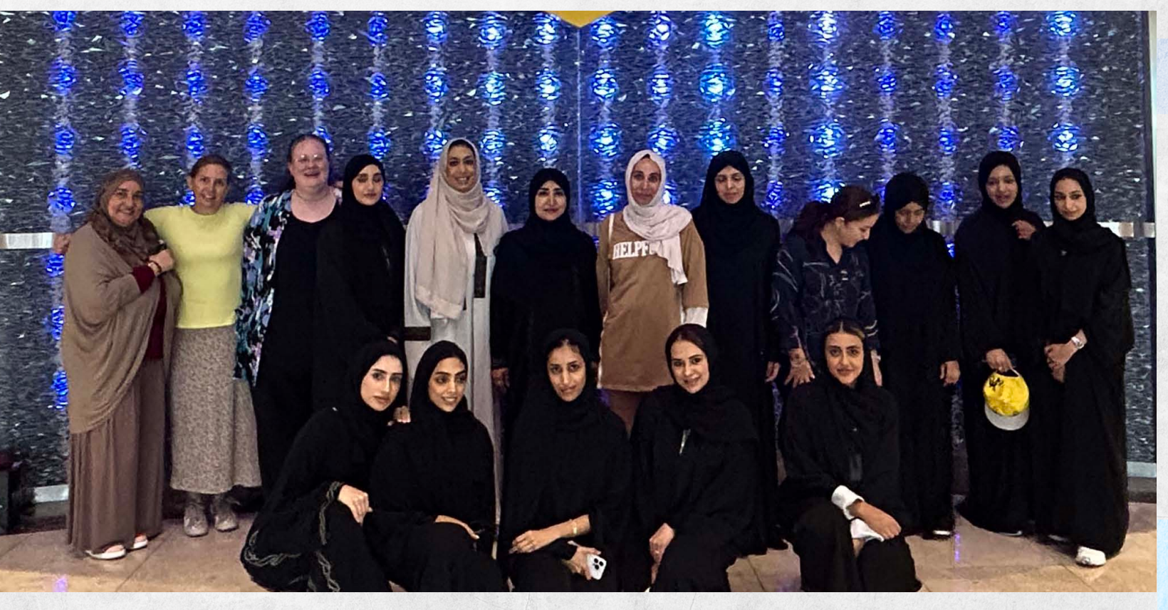
EMIRATI WOMEN'S DAY AT WARNER BROTHERS 20<sup>TH</sup> MARCH 2023