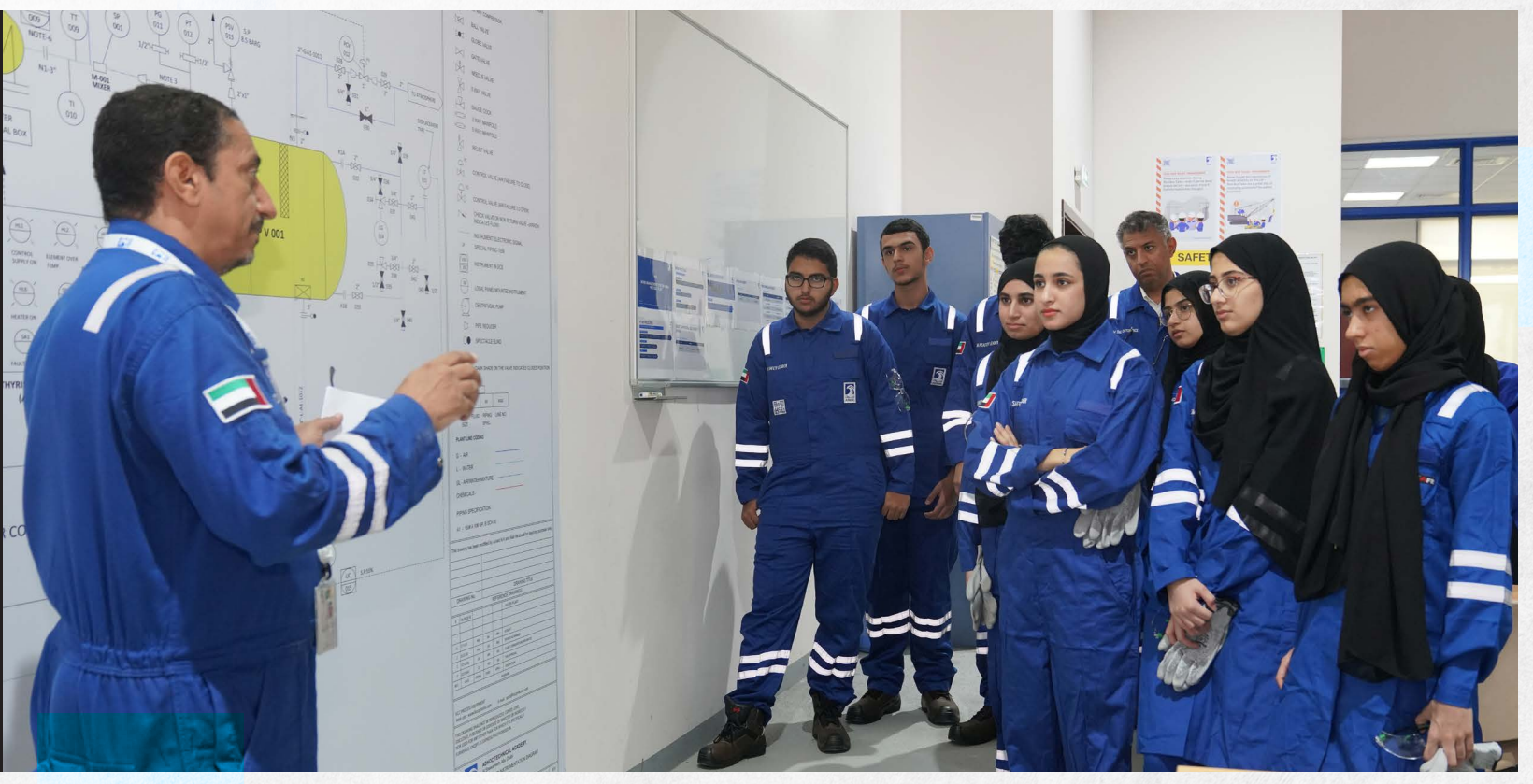
ATA SUPPORTING RO'YA PROGRAM 13<sup>TH</sup> JULY 2023