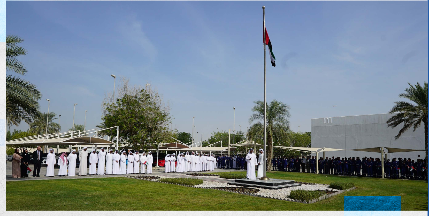
UAE FLAG DAY COMMEMORATION 3RD NOVEMBER 2023