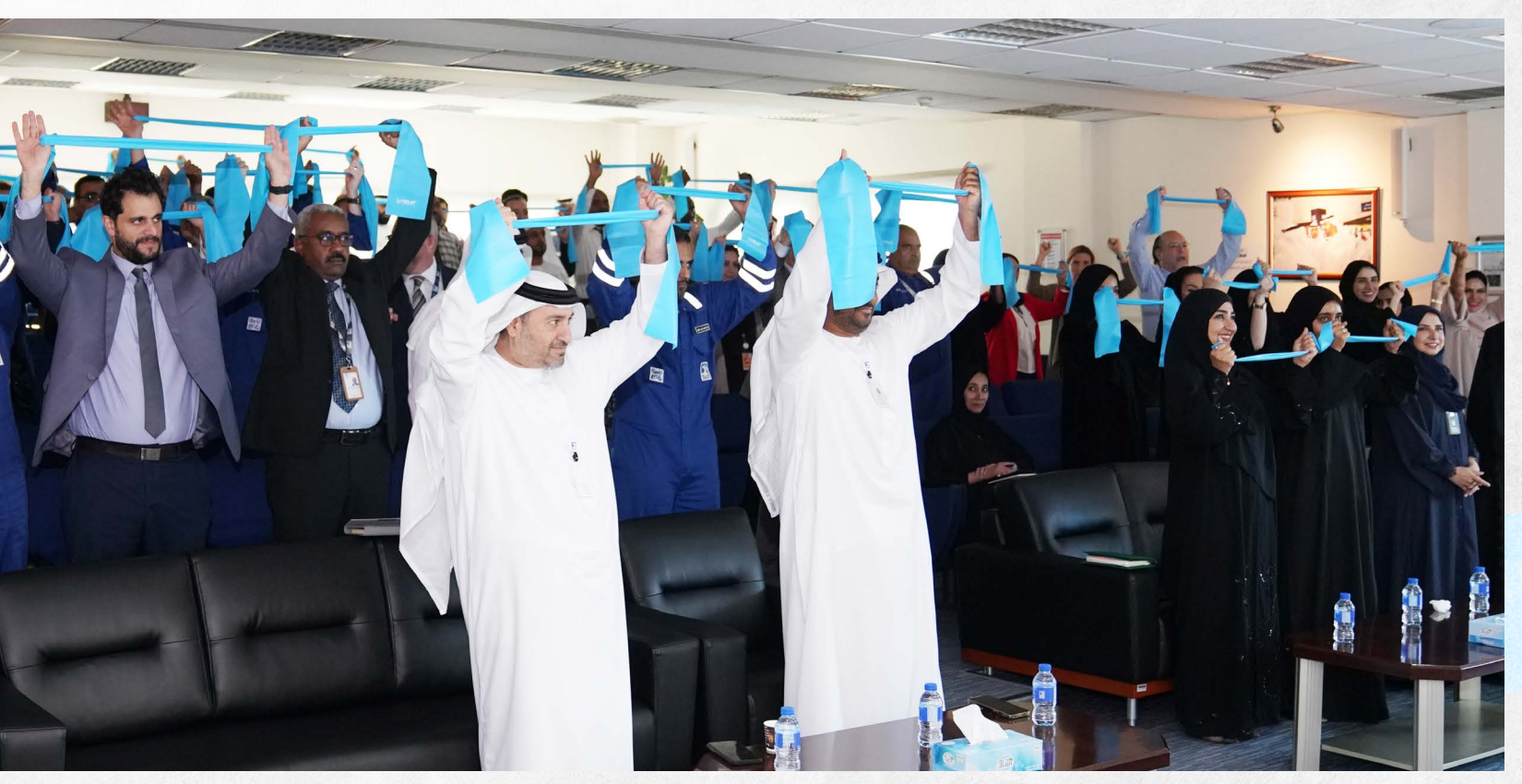
PEOPLE CONNECT' ENGAGEMENT SESSION 9<sup>TH</sup> NOVEMBER 2023