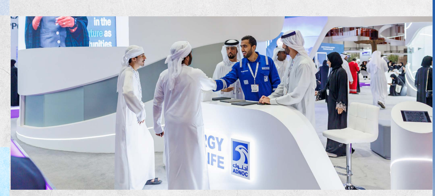
TAWDHEEF X ZAHEB 13<sup>TH</sup> - 15<sup>TH</sup> NOVEMBER 2023