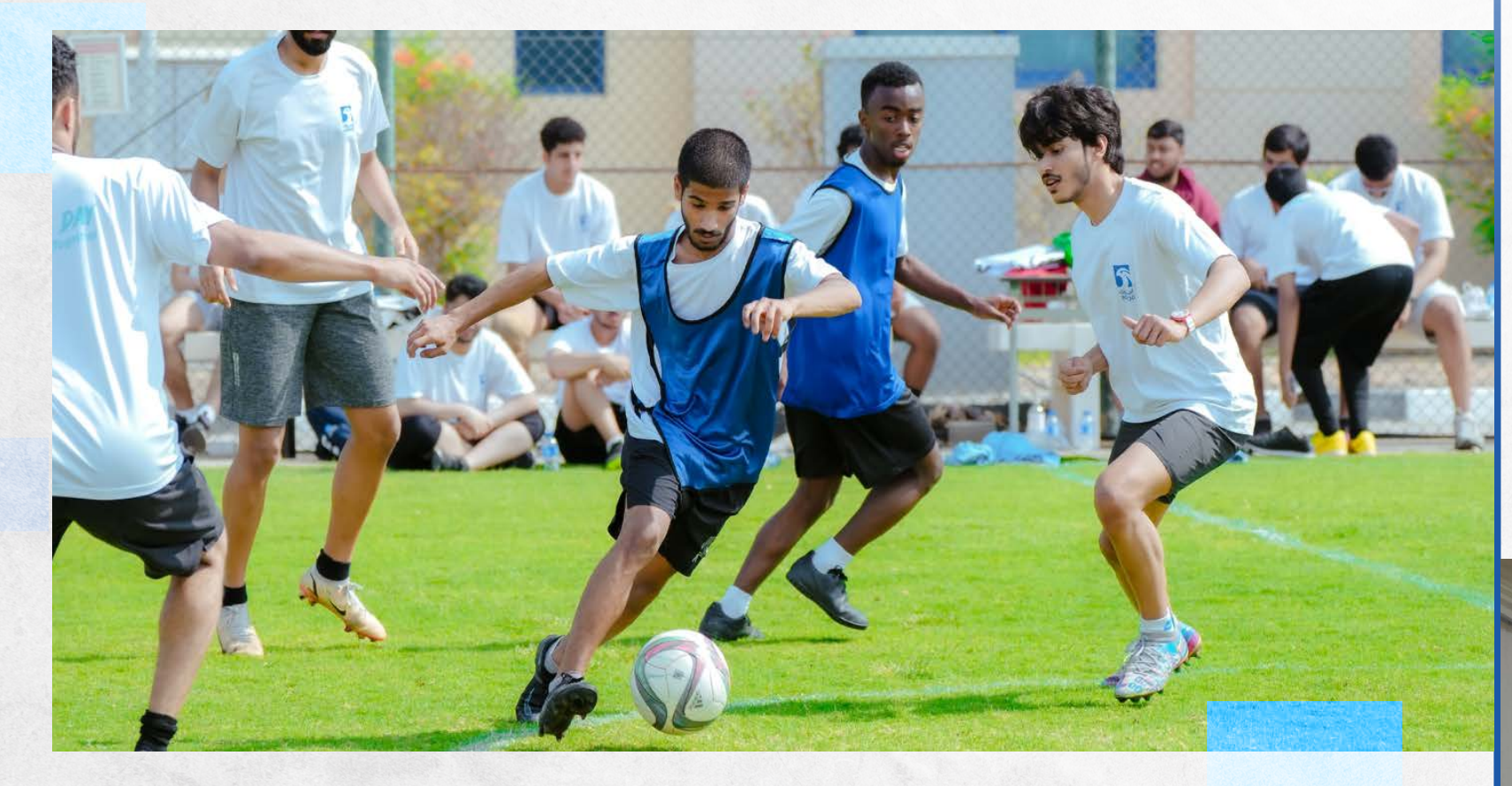
ATA SPORTS DAY 2023 15<sup>TH</sup> MARCH 2023