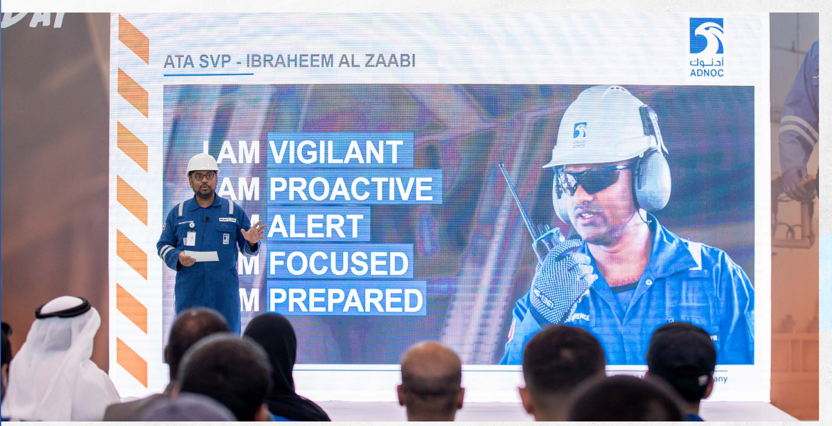
ATA SAFETY DAY 23RD SEPTEMBER 2023