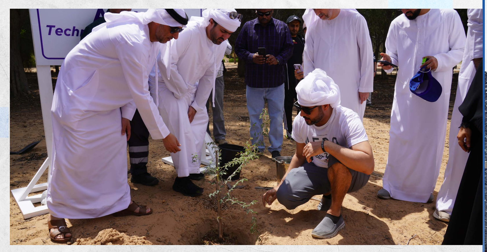
STAFF DAY-OUT ON AL SAMALIYAH ISLAND 24<sup>TH</sup> AUGUST 2023