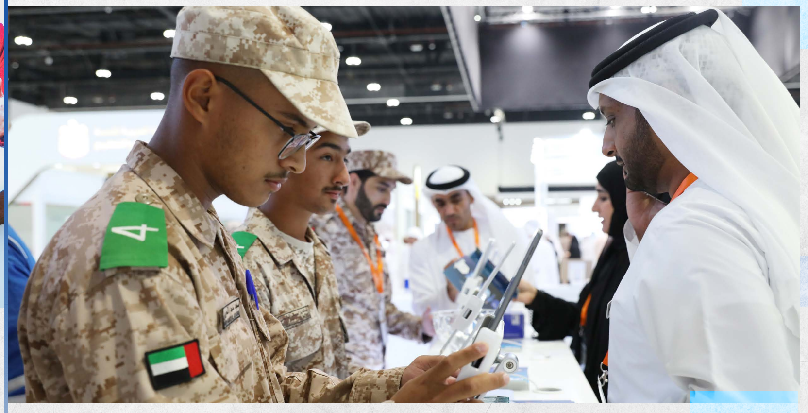
2023 NATIONAL SERVICE CAREER FAIR 6<sup>TH</sup> - 8<sup>TH</sup> MARCH 2023