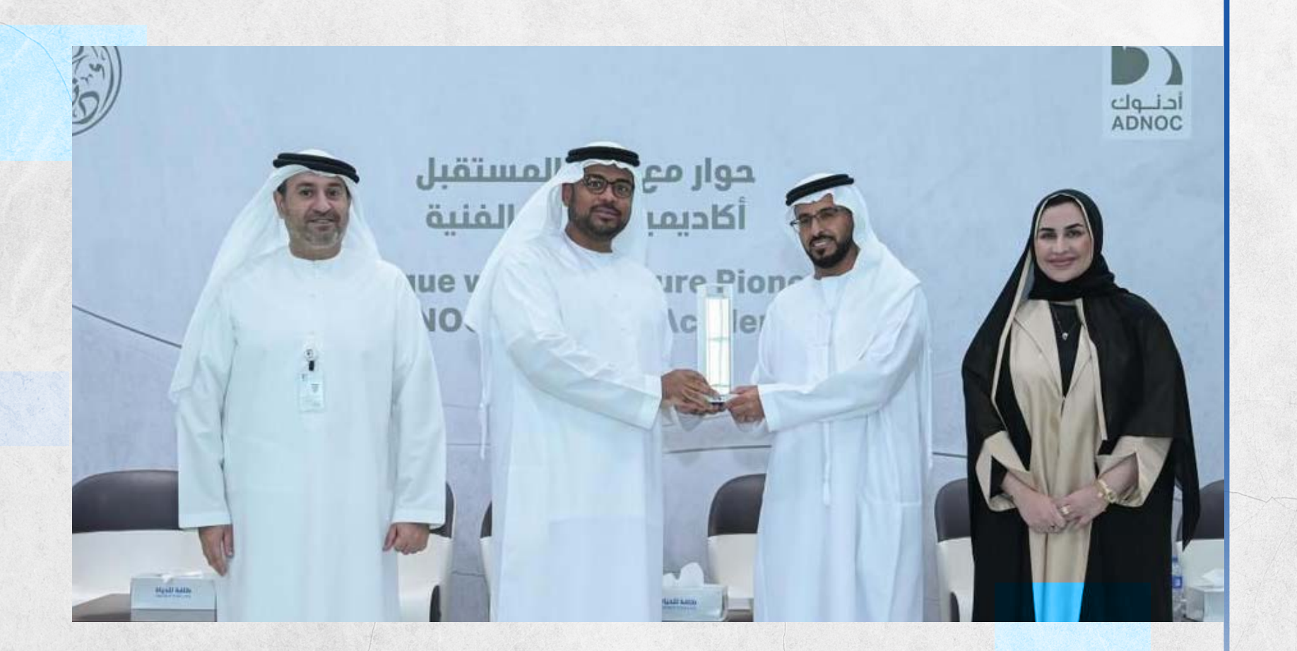
26<sup>TH</sup> OCTOBER 2023