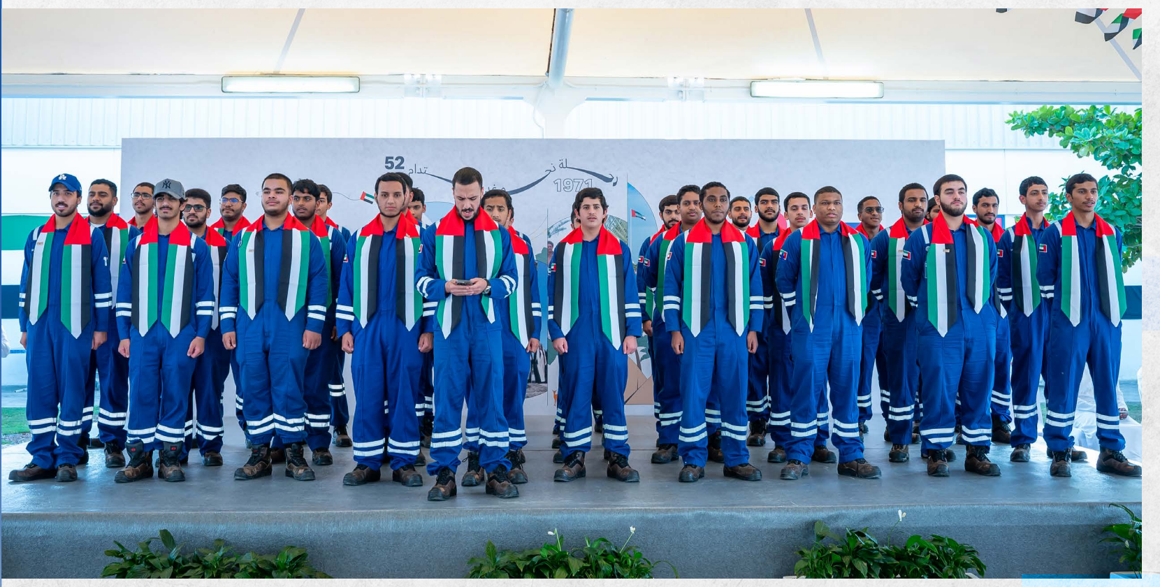
ATA CELEBRATES UAE 52ND NATIONAL DAY 29<sup>TH</sup> NOVEMBER 2023