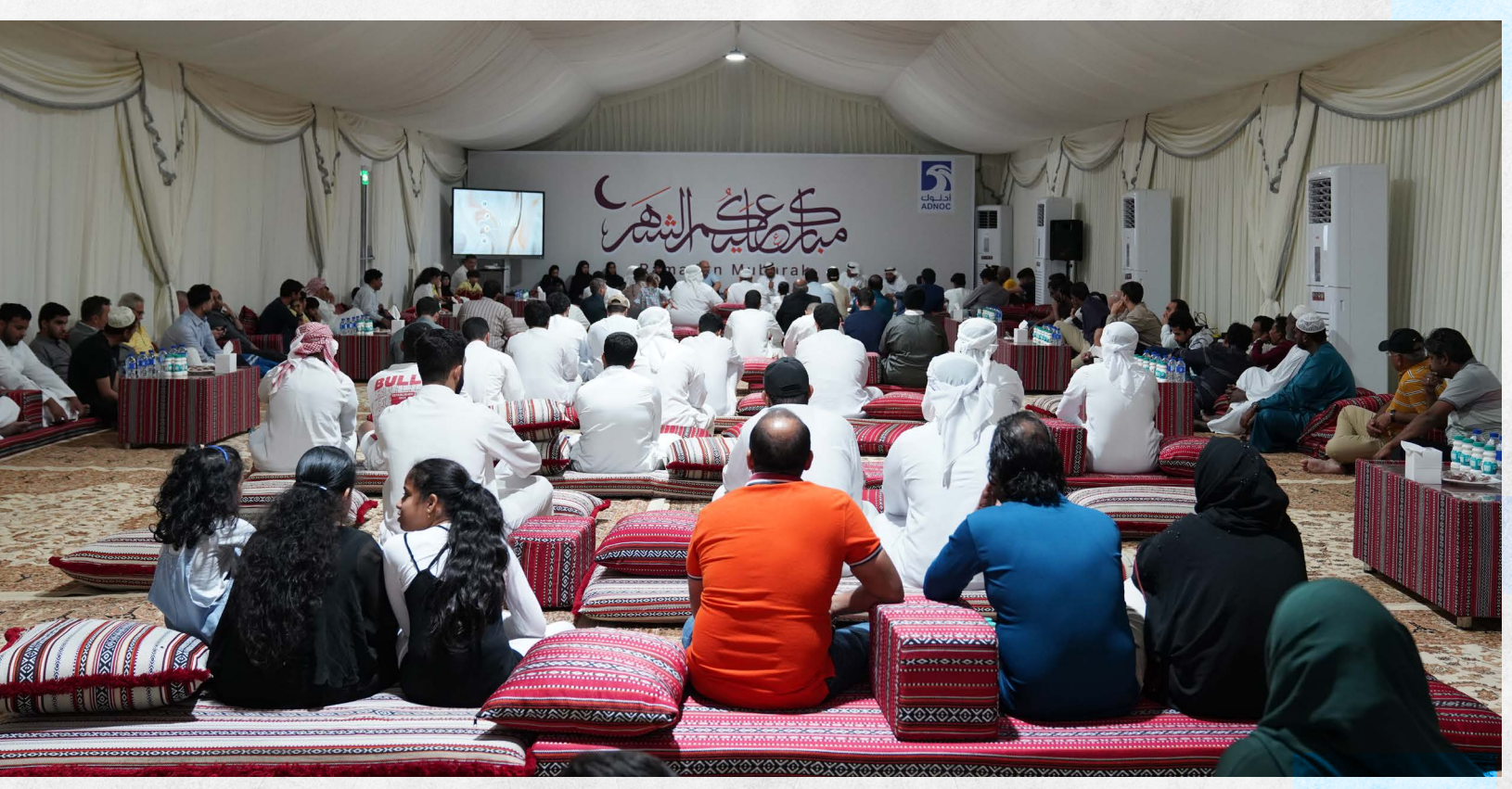
RAMADAN IFTAR GATHERING 12<sup>TH</sup> APRIL 2023