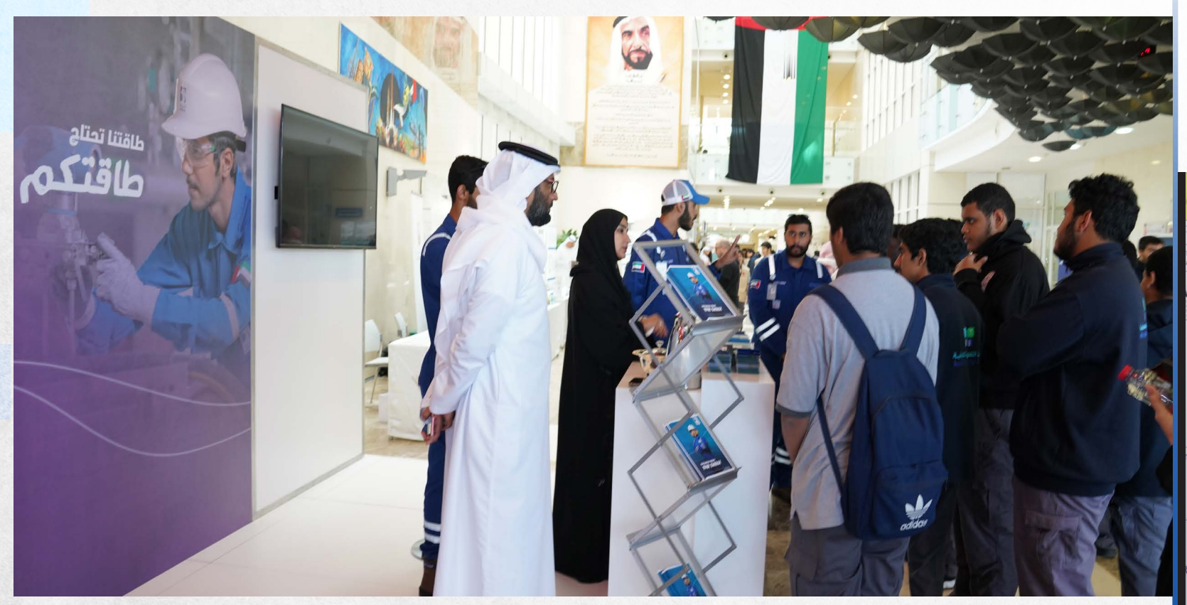
TVET INNOVATION WEEK 2<sup>ND</sup> - 9<sup>TH</sup> FEBRUARY 2023