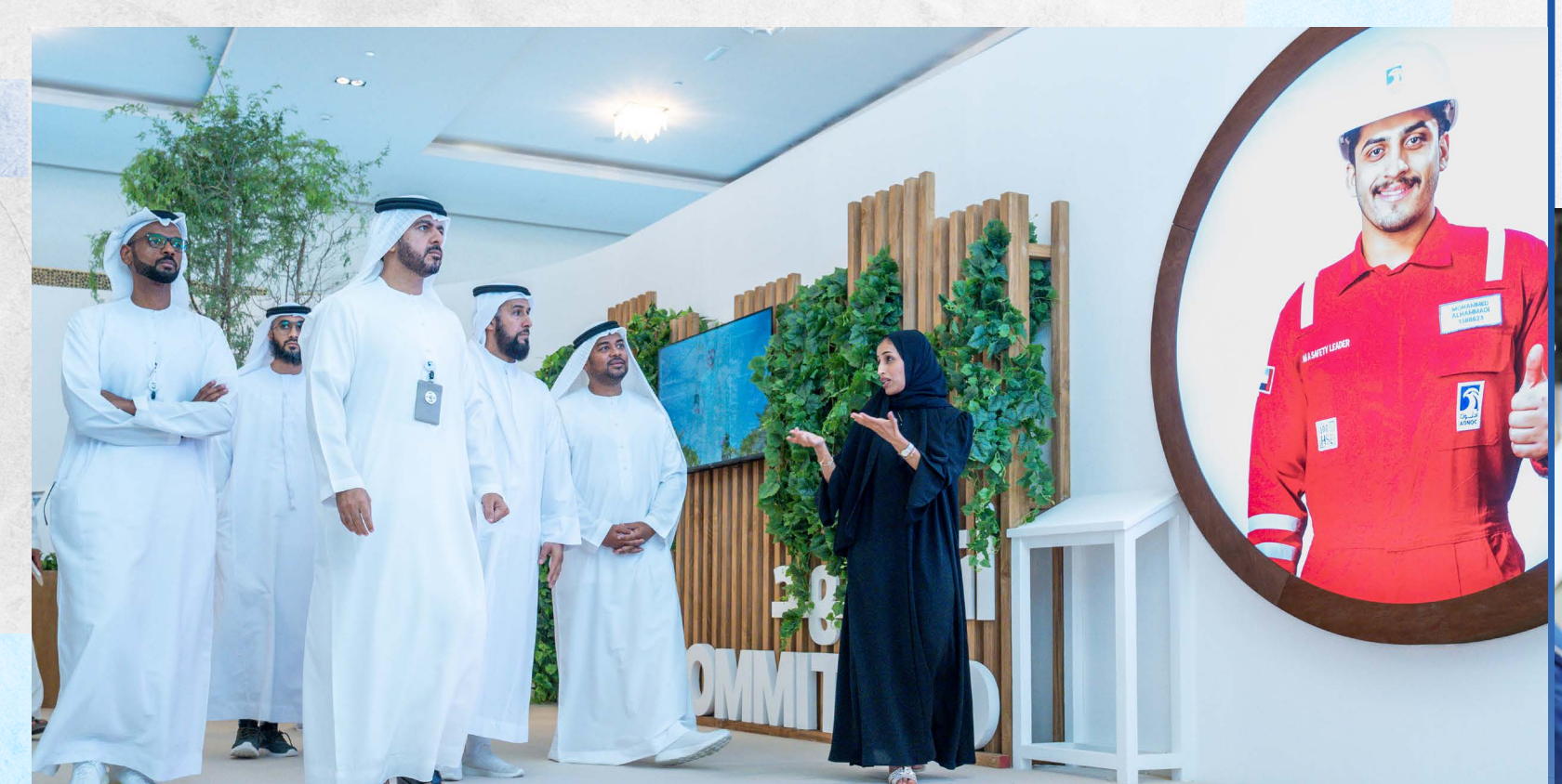
ATA CAMPAIGN & ROADSHOW – AL DHAFRA 11<sup>TH</sup> - 15<sup>TH</sup> OCTOBER 2023