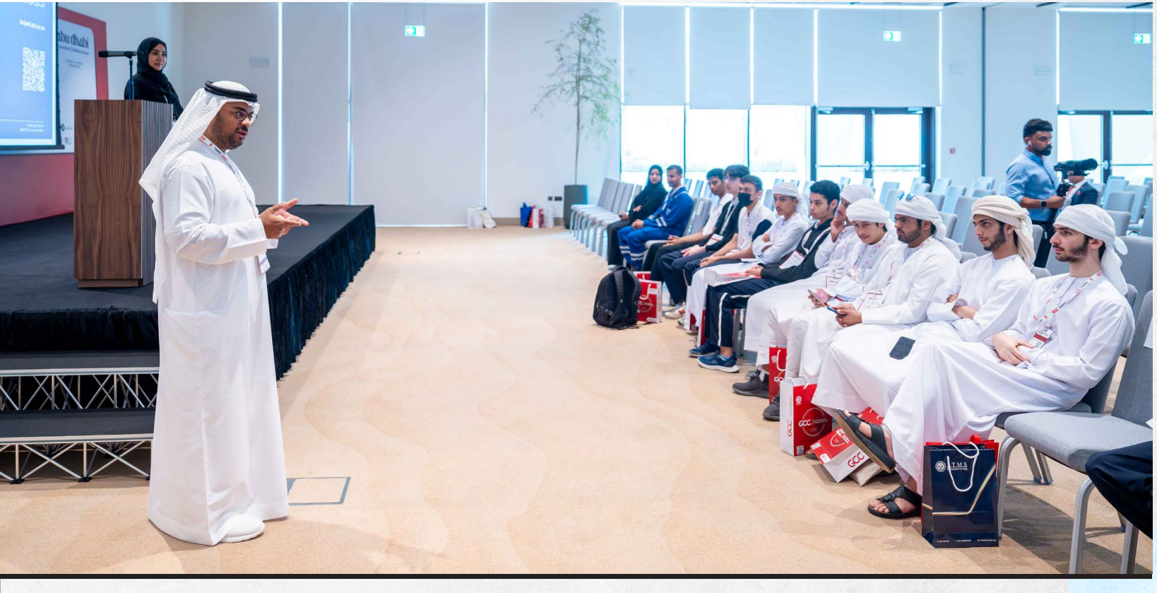
GCC EXHIBITION FOR TRAINING AND EDUCATION 2023 24<sup>TH</sup> - 25<sup>TH</sup> OCTOBER 2023